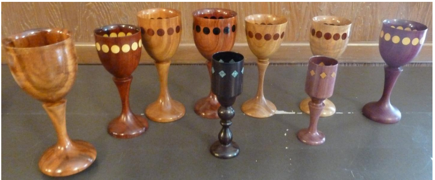
Rick Haseman shows his ever increasing inventory of GOBLETS. His method of sealing the insides leads to non dripping. We should all try to make one to be used in a toast to CCW at the Picnic and, or Holiday Luncheon