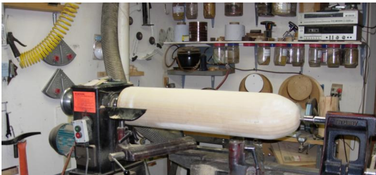
This is the Bomb I was contracted to turn